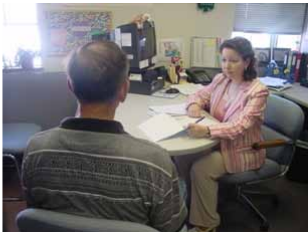
A Probation and Parole Officer with the Missouri Department of Corrections interviews a probationer.